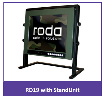
RD19 with StandUnit