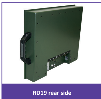
RD19 rear side