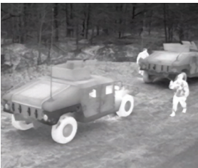
High sensitivity thermal imagery

Reduces operator fatigue for long duration missions without sacrificing field hardening Delivers unmatched image quality with built-in STACE™ technology that digitally sharpens, tunes and enhances contrast for exceptional image detail Continuous Optical Zoom from 2° to 20° HD Display delivers clean images and crisp symbology Provides geo-location of targets with eye safe laser rangefinder E-STAB improves operational effectiveness with no image latency Simplified controls are intuitive and minimize user fatigue